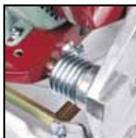
Recoil spring counterbalanced cutting head