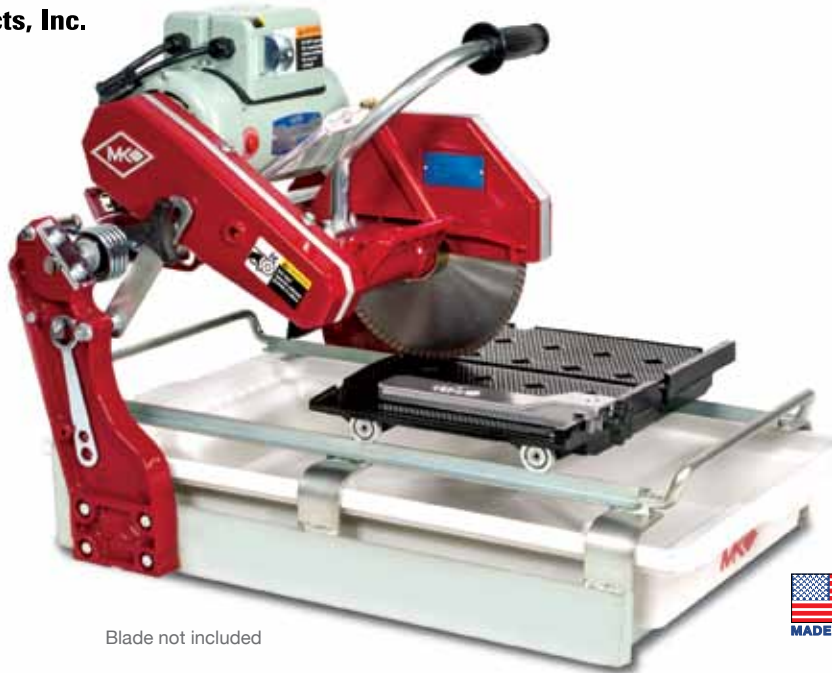
Blade not included