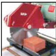
Heavy-duty blade shaft assembly with dual-sealed bearings