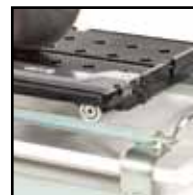
Cutting table travels on steel roller wheels to provide precise cutting

1315 Storm Parkway, Torrance, CA 90501 | P 800.421.5830 | www.mkdiamond.com | F 310.539.5158