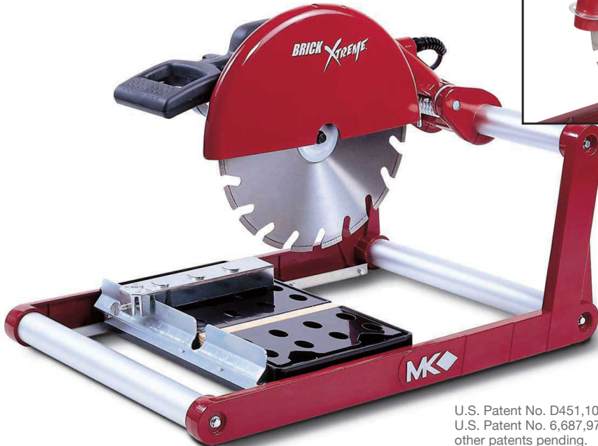
BX-3 Dry Cutting Saw Part# 157721X

U.S. Patent No. D451,109; U.S. Patent No. 6,687,972; other patents pending.