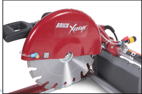
BX-3 Wet Cutting Saw Part# 157721WX