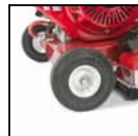
Optional straight cut wheel kit Part # 172014