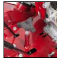
Depth control knob for quick adjustments