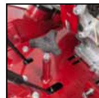
Depth control knob for quick adjustments