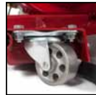
Pivoting wheels for easy maneuverability