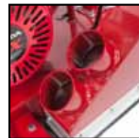
Vacuum ports for convenient connection to dust collector

Highly productive crack chasing saw for cutting concrete or asphalt. Cuts 6' to 8' per minute (up to 3,000' per day) depending on material being cut. Highly maneuverable--uses small diameter dry diamond blade allowing for tighter turning radius. Can be used for joint clean-out with optional straight cut wheel kit accessory.