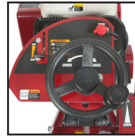
Easy access control panel