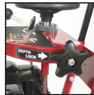
Precision adjustable depth control