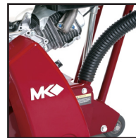
Vacuum port for dust collection