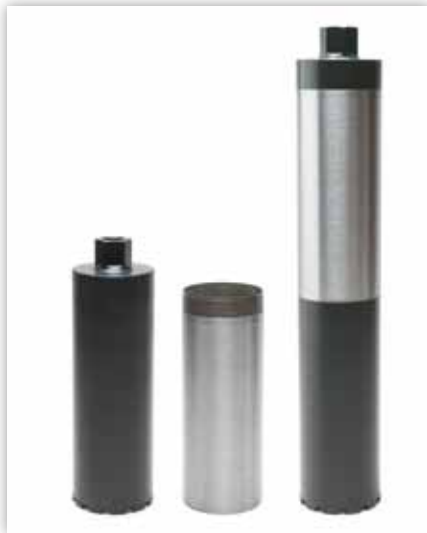
Tube Extensions are 12" in height