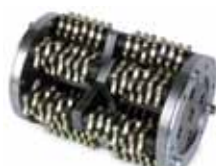
6-Point Carbide Drum