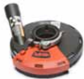
5in Hinged IXL Shroud