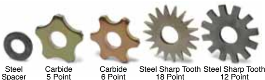
Steel Spacer Carbide 5 Point Carbide 6 Point Steel Sharp Tooth 18 Point Steel Sharp Tooth 12 Point