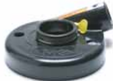
7in Full IXL Shroud