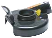
7in Hinged IXL Shroud