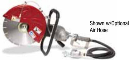
Shown w/Optional Air Hose