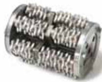
5-Point Carbide Drum